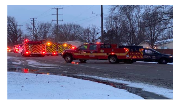
Rescue 1 – 2010 Ford 350