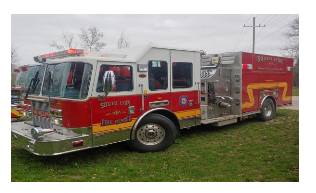
Engine 2 – 2008 KME Predator