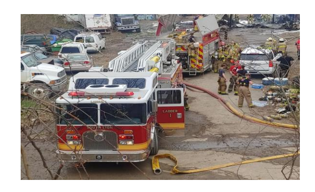
Ladder 1 – 2000 KME Aerial